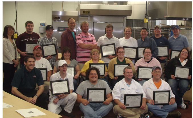
2011 Graduating Class of the Bread & Rolls Certification Program

The Sweet Goods Certification Program will be offered in spring 2012. It consists of five (5) two-day modules. Students must complete all five modules to receive AIB's Sweet Goods certification certificate. Students are not required to complete all five modules in the same year and may participate in individual modules/seminars without receiving certification. These seminars will be conducted by the highly qualified team of instructors from the AIB School of Baking and will be held in the R.W. Hiller Bakery Technical Center at Valley Bakers Cooperative Association in Greenville, WI.